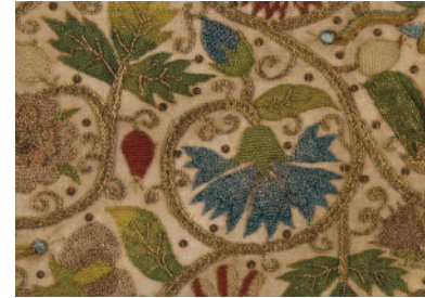
17 th Century panel, metal thread, hand embroidery