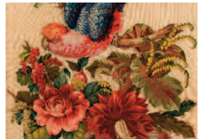
Parrot, Berlin wool work, late 19 th Century