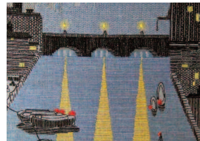
EG 4167 London Bridge at Night by Miss Cowie, 1936