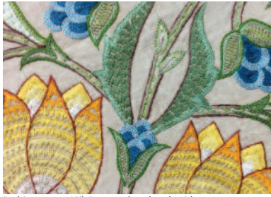
Cushion cover 19 th Century, hand embroidery

STOP PRESS: The Collection Appeal stands at £4500. Our warmest thanks for four generous contributions made within a month our announcement at the Guild 2016 AGM and more recently.