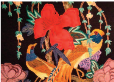
Chinese Pheasants, early 20 th Century