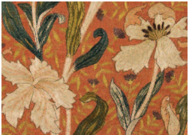
EG 3594 Panel designed by John Henry Dearle